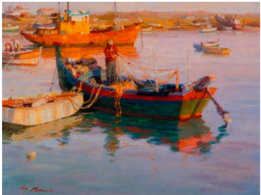
"Last Light, Lagos, Portugal," by Ned Mueller, oil, 12 x 16. First Place winner