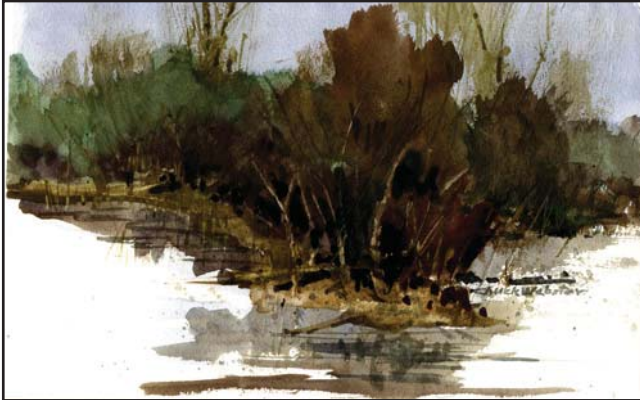
"Water's Edge", watercolor 8x12 by Chuck Webster