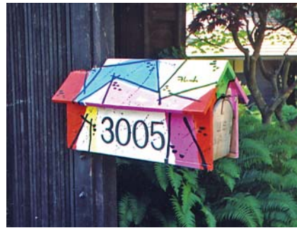
Can you guess who's mailbox this is?