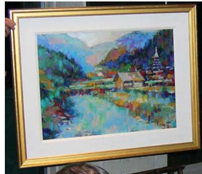
Best landscape, Lyle Silver