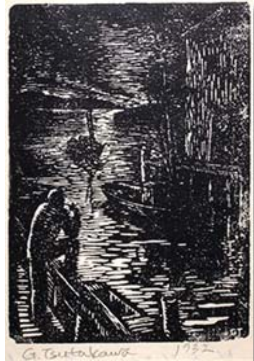
Title: South Lake Union , block print 1932, 8" x 4"